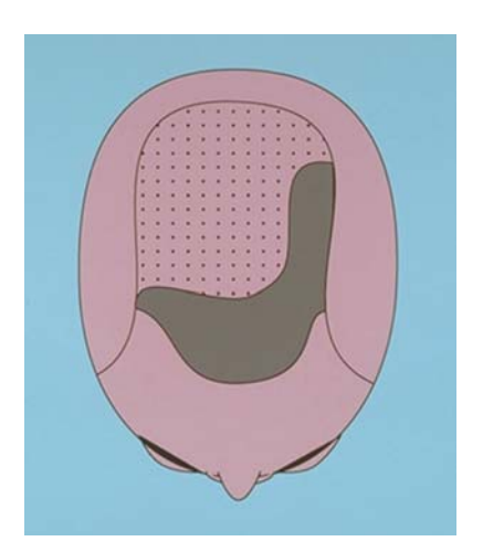
Figure 7. The shaded area illustrates the "Hockey Stick" distribution of densely placed grafts. This pattern is useful in repairs when the donor reserves are severely depleted. The dots represent the placement of "tacking hairs." These are small follicular units that hold down the hair that is combed over it.

The grafts used in the more sparse areas are called "tacking hairs." These hairs serve to anchor the hair combed over them from the more densely transplanted areas. Tacking hairs are composed of only 1- and 2-hair follicular units to conserve the donor supply and avoid making these rather isolated grafts appear unnatural. This "tacking" helps to keep the longer frontal hairs in place during routine activities, and in the wind. The "hockey stick" and "tacking hair" are explained in more detail in The Aesthetics of Follicular Transplantation<sup>4</sup> (Figure 7).