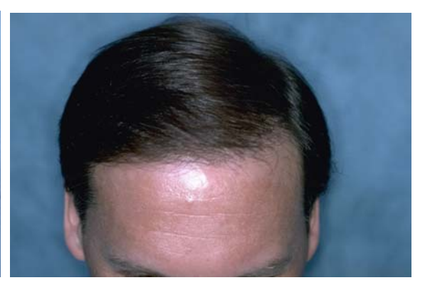
Figure 6. A) Schematic of "Side Weighting" accomplished by increasing the density of sites in the part side of the scalp and placing larger follicular units in those sites. B) Front view of patient previously shown in Figure 8. C) The dense, linear row of plugs was successfully camouflaged in just one session by using larger, closely spaced follicular units on the part side of his scalp.

In a repair, weighting techniques are important because the limited donor reserves makes planning around a specific styling pattern critical to achieving the best camouflage. Although the patient's grooming preferences should always be taken into consideration, when there has been significant depletion of the donor reserves along with many cosmetic problems, the patient may not have many options. In this scenario, the one optimal way of performing the repair must be identified by the physician and explained to the patient in advance. Generally, side-to-side grooming with the hair combed diagonally back will give the best coverage. This will enable layering to give fullness to the frontal hairline and allow some of the hair mass to be combed backward to provide indirect coverage to the crown. All things being equal, left-to-right grooming is preferable over right-to-left, since the former is the styling preference of the majority of men and will draw less attention to the transplant. If the skin on the dominant side of the scalp is not scarred, both follicular unit sorting and spacing sites close together should be used to increase density. With a scarred scalp, only sorting should be used to limit further damage to the scalp.