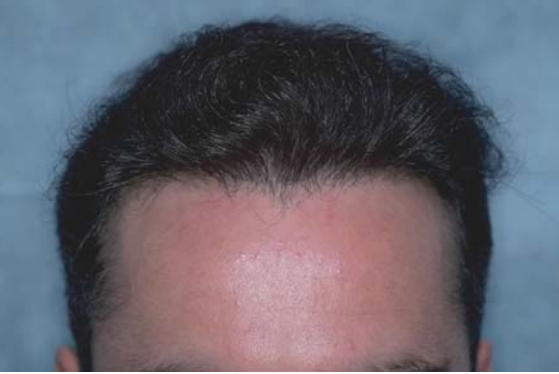
Figure 4. A) Very pluggy frontal hairline from old punch-graft technique. B) A slight Widow's Peak was created to break up the straight-line appearance of the hairline and to camouflage the plugs. This repair was accomplished with just one session of Follicular Unit Transplantation.