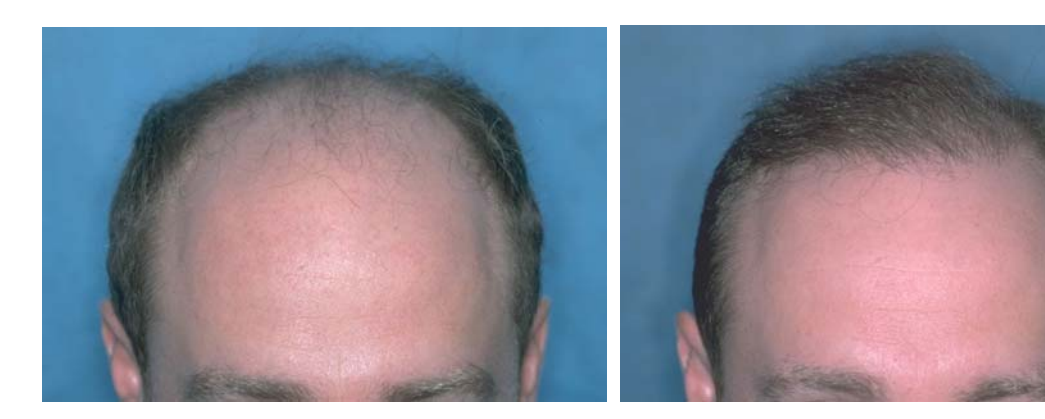
Figure 8. A) Patient with a Norwood class 6 balding pattern who had several "Y-Shaped" scalp reductions to decrease the size of his bald crown. The procedures left significant scarring, a low donor density and a tight scalp. B) The defect was camouflaged with a single procedure of 1,825 follicular unit grafts. C) Frontal view before repair. D) Frontal view showing the significant change in his appearance after one session. A second procedure is planned to create greater density and increase fullness.