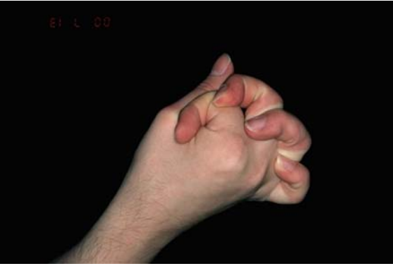
Figure 10 . A) A wide donor scar in a patient with Ehlers-Danlos Syndrome Type III, an inherited defect of connective tissue often associated with poor wound healing. B) Hyper-extensible joints seen in a patient with EDS. This sign can be identified during the physical exam, alerting the physician to an increased risk of a widened surgical scar.

As emphasized in the preceding discussion, a depleted donor supply is the major limitation to a successful repair. The inability to harvest additional hair is caused by two main factors. The first factor is the physical limit set by the combination of low donor density and poor scalp mobility. When donor density is low, a larger strip must be harvested to obtain an adequate amount of hair. A tight scalp, however, limits the size of the strip that can be removed. After multiple procedures, attempting to harvest additional hair is no longer worth the risk of a possible widened scar. Every hair transplant procedure simultaneously decreases donor density and scalp laxity, but poorly executed surgery does this to a greater degree and decreases the supply without making proportionate cosmetic improvements in the recipient scalp.