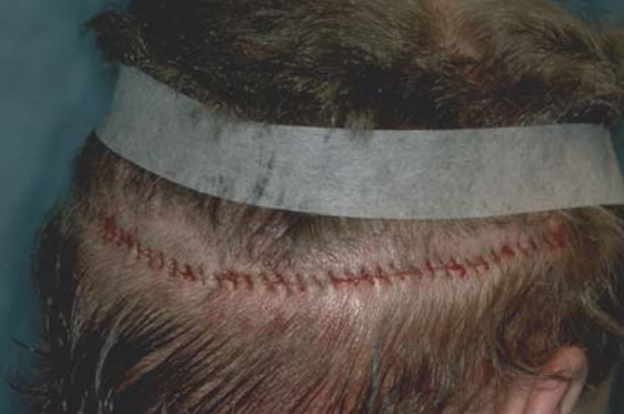
Figure 12. A) Old technique of suturing using large bites. B) Repair using a running stitch of absorbable sutures with smaller bites. (Note: the authors now make even smaller bites than shown in this photo using 5-0 Monocryl on a PS-2 needle).