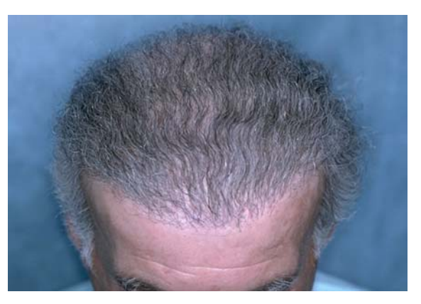
Figure 5. A) Schematic of "Forward Weighting" accomplished by increasing the density of sites in the frontal portion of the scalp and placing larger follicular units in those sites. B) Extensive scarring from a sew-on hairpiece and 3 hair transplant sessions using large plugs, many of which didn't grow well. Luckily, the patient had salt & pepper hair, ideal hair for a repair. C) Dramatic improvement was accomplished with just one session using forward weighting. One problem that we could not correct was the very low hairline.